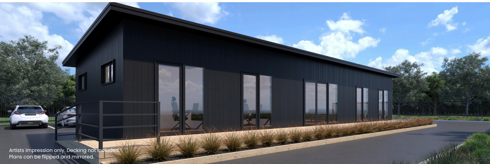
Artists impression only. Decking not included. Plans can be flipped and mirrored.

Mono or Gable | 6 Bed | 2 Bath | Open Plan Living