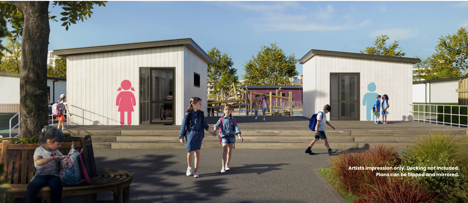
Artists impression only. Decking not included. Plans can be flipped and mirrored.

2 Mono Blocks | 1+1 Cleaner Closets | 4+2 Toilets | 1+1 Accessible Bathrooms | 2 Urinals