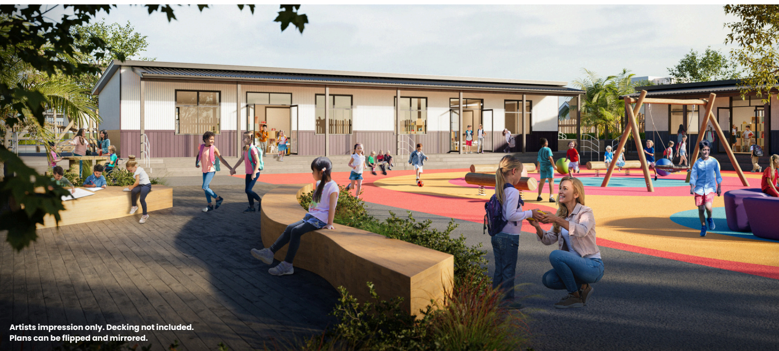
Artists impression only. Decking not included. Plans can be flipped and mirrored.