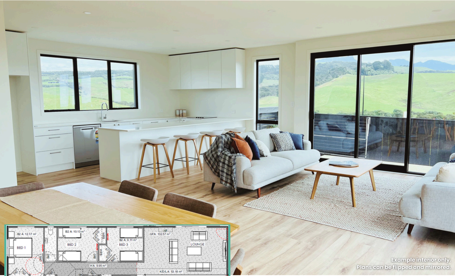
Example interior only. Plans can be flipped and mirrored.

Developer Series | 4 Bedroom | Open Plan Living | 1 Bathroom | Separate Laundry