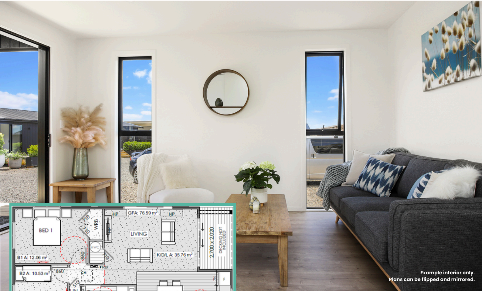
Example interior only. Plans can be flipped and mirrored.